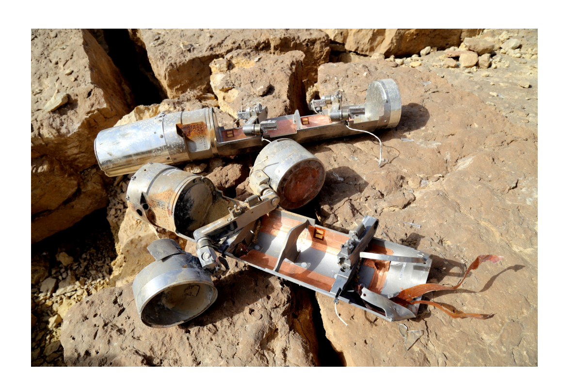
Failed Sensor Fuzed Weapons Yemen 2015